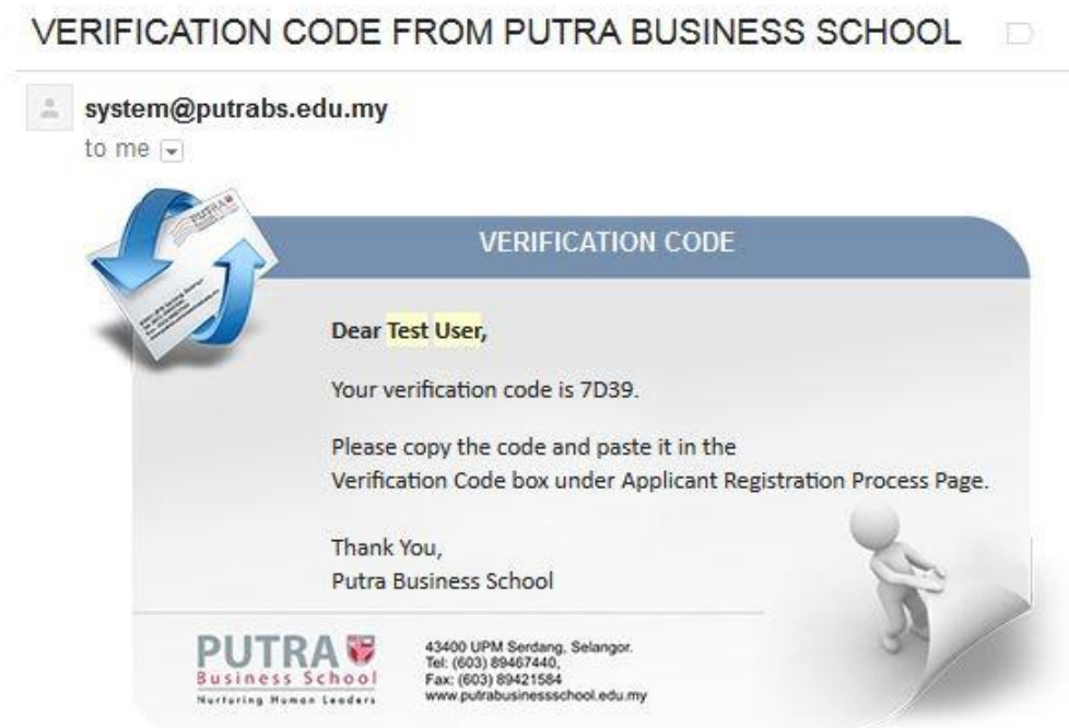
Figure 5: Verification code message