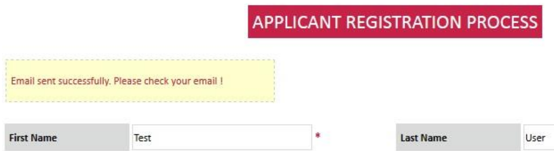
Figure 4: Notification that email has been sent out